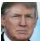
Donald J. Trump

“Big day planned on NATIONAL SECURITY tomorrow,” Mr. Trump wrote on Twitter on Tuesday night. “Among many other things, we will build the wall!”